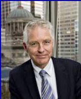
Hon. Justice Murphy